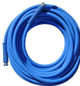
L.P. Hose 20 mt with fittings 1/2 " F.