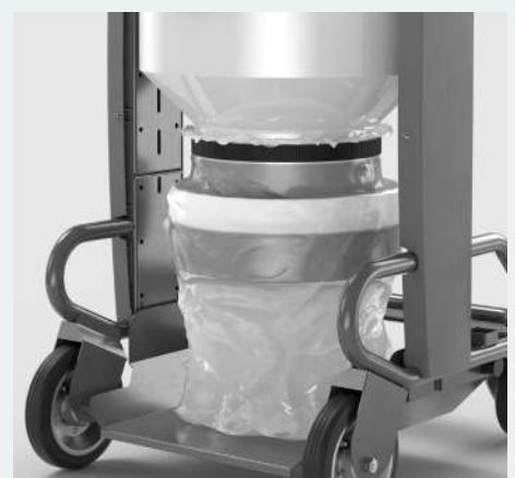
Longopac® system available